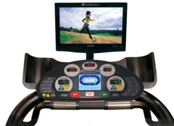
w/ 19" LCD HDTV

Treadmill specifications subject to change without written notice. Warranties outside the U.S. may vary - please contact your dealer for details.