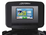
DISCOVER SI CONSOLE