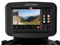
DISCOVER SE3 CONSOLE