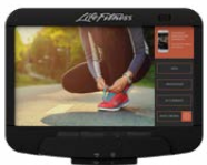
DISCOVER SE3 HD CONSOLE

The Elevation Series includes these console choices: