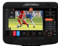
DISCOVER ST CONSOLE